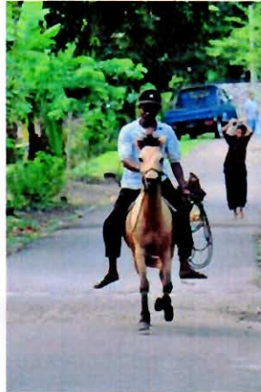
An effective means of escaping surgery