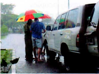
A surgical diagnosis of a punctured tyre