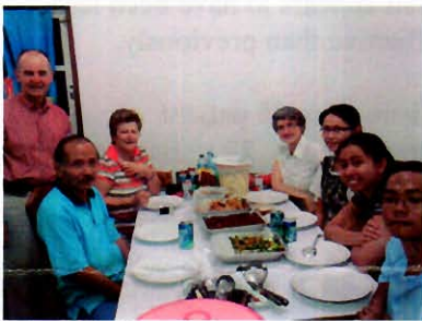
The Halilulik surgical team

Consultations and surgical procedures mainly comprised goitres, head and neck lesions, appendicitis, hernias, burn scar contractures and one large ovarian cyst (9kg). There were 215 consultations and 134 operations performed over the two weeks. Histology on some operative specimens are now being undertaken in Brisbane. The visit was highly productive, smoothly managed and appreciated by all. Excellent progress has been made. The hospital is in desperate need of X-Ray equipment.