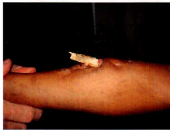
A chronic osteomyelitis of the tibia about to be removed