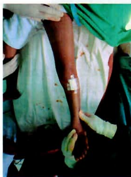
The solution = i can now walk well!