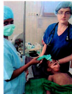
Teaching hand ventilation technique