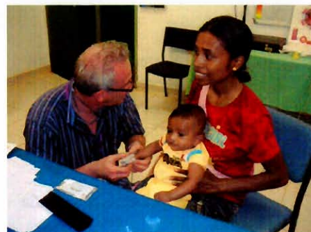
A sweet bedtime story

There were 35 patient consultations, 22 in Baucau (inc Los Palos) and 13 in Maliana and 20 surgical procedures, 12 in Baucau and 8 in Maliana. Cleft lip and cleft palate comprised the majority of operations.